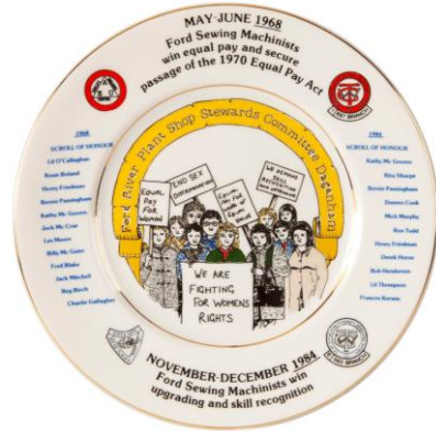
A plate to commemorate the female Ford workers strike for equal pay, 1968