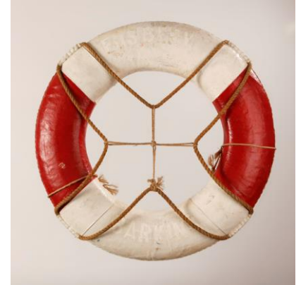
Lifebelt made by Fosbury of Barking, 1930s