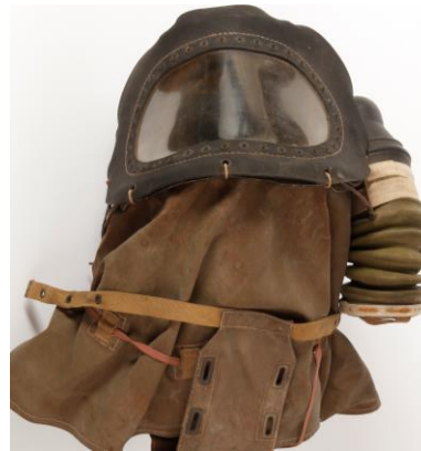
A baby's gas mask from WWII, 1939-1945