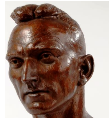
A portrait bust of marathon runner Jim Peters, 1955

Our camera has broken and can only take close up photos of objects. Now we can't identify what the objects are! Can you help us to work out what these photos are showing? They are all objects that are on display within the museum.