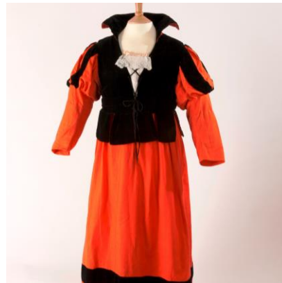
Tudor girls dress made for the Pageant of Barking, 1931