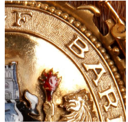
Clue: I symbolised the role of Barking's most important person