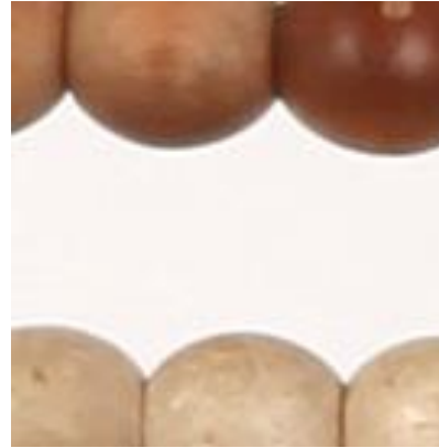
Clue: For generations I helped Dagenham children learn their sums