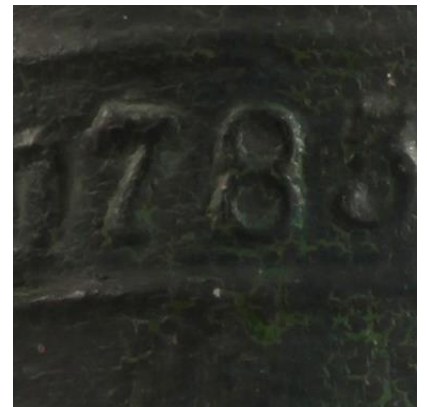
Clue: You would have found me on the roof of a well-known Chadwell Heath home