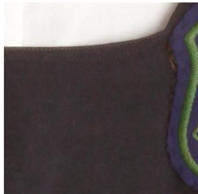
Clue: School girls wore me whilst attending a Barking school