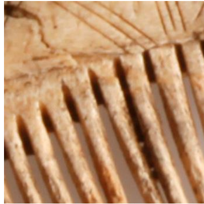
Clue: Ancient people used me to make themselves pretty

Our camera has broken and can only take close up photos of objects. Now we can't identify what the objects are! Can you help us to work out what these photos are showing? They are all objects that are on display within the museum.